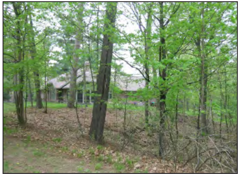
View of house from detached garage/work shed.